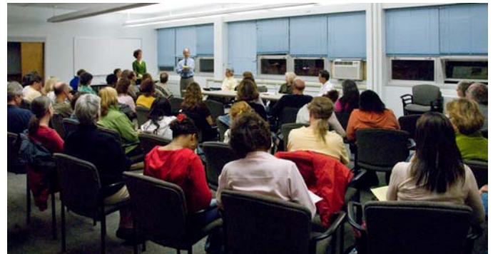
IBPA Meeting Oct 2007